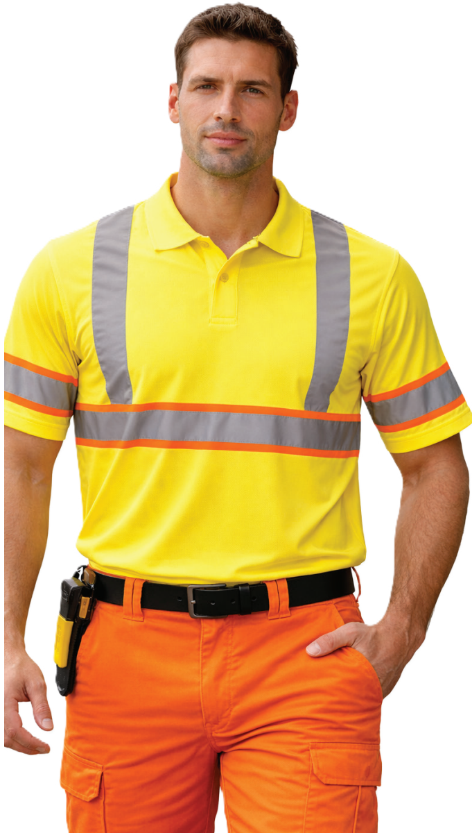
Short Sleeve Hi-Vis Work Shirt

Flexible and comfortable for everyday work use. Designed to support mobility and visibility on site.