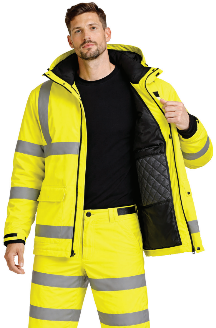
Thermal Work Jacket

A softshell jacket is a versatile outerwear piece designed for comfort, flexibility, and protection in varying weather conditions. Made from breathable, water-resistant, and windproof materials, it offers excellent mobility while keeping the wearer dry and comfortable.