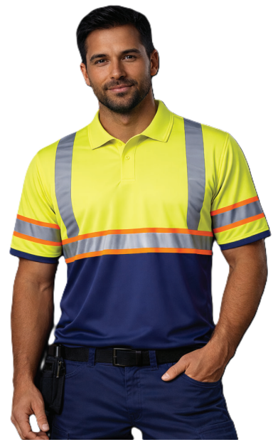
Short Sleeve Hi-Vis Work Shirt