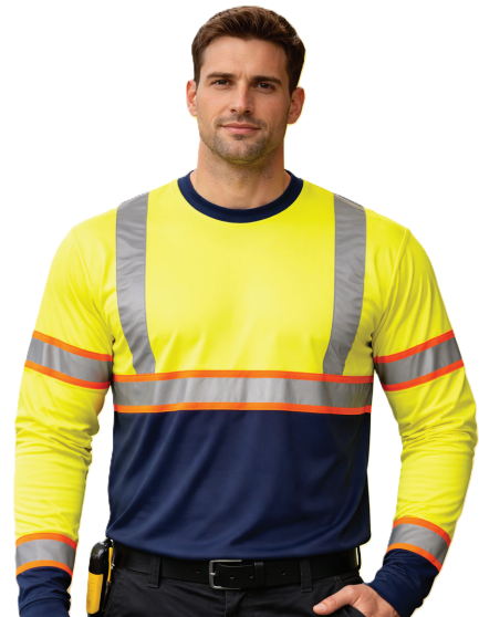
Long Sleeve Hi-Vis Work Shirt

Designed for durability and comfort in demanding work environments. Reflective stripes ensure maximum visibility and safety.