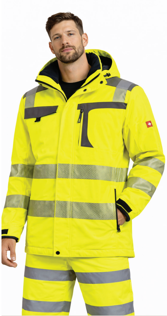
Hi-Vis Work Jacket

Durable and comfortable jacket designed for all-day safety in demanding conditions.