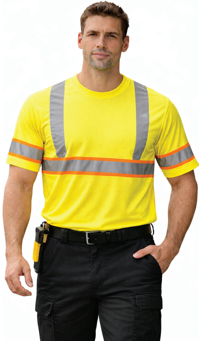
Short Sleeve Hi-Vis Crew Neck Work Shirt

Flexible and comfortable for everyday work use. Designed to support mobility and visibility on site.