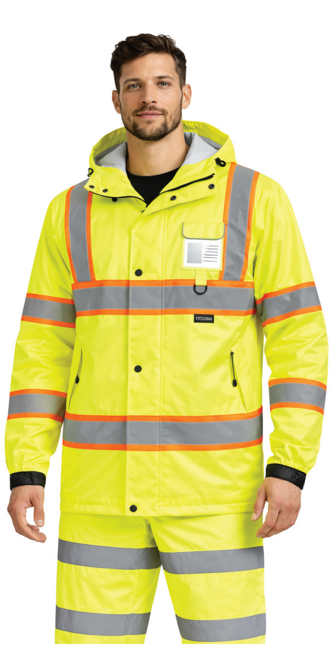
Hi-Vis Rain Jacket

Durable and comfortable jacket designed for all-day safety in demanding conditions.