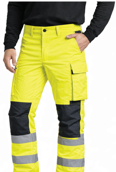
Hi-Vis Work Pants

Lightweight, breathable vest with high-reflective strips for maximum visibility.