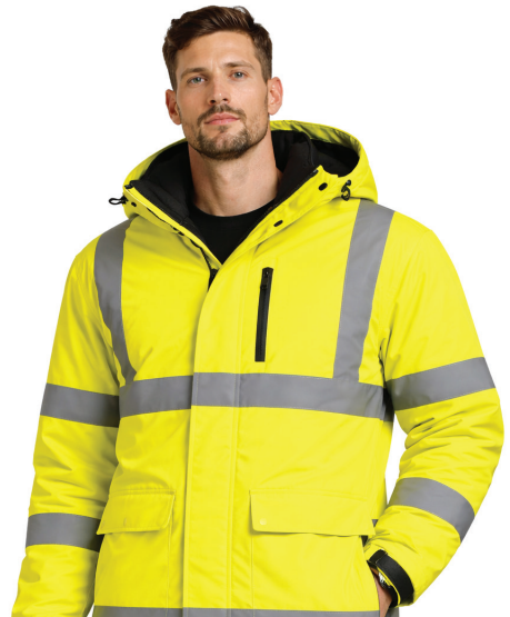
Insulated Winter Jacket

A fleece jacket is a lightweight and comfortable outerwear option designed to provide warmth while maintaining breathability. Made from soft, insulating materials. Its flexible structure allows ease of movement during daily tasks, while the durable fabric ensures long-lasting use.